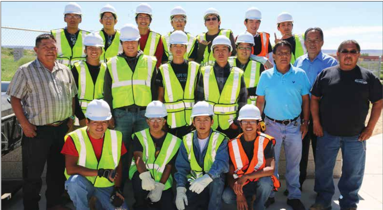
16 Hopi High School students will participate in the Home Construction Apprenticeship Program, an 8 week program