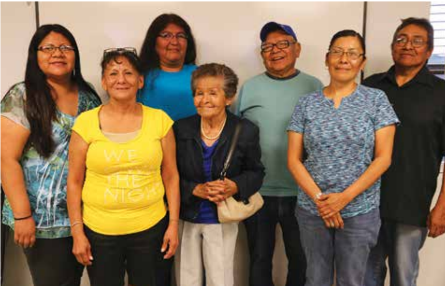
Yuwehloo Pah’ki new Board of Commissioners took Oath of office on June 3